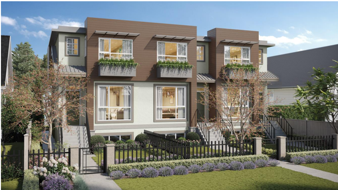
Looking northeast along Salisbury Ave

The landscape plan includes a mixture of trees, shrubs, perennials and groundcover plants throughout the site. Each unit proposes a well-designed gardening area with planting beds and space for residents to gather. The design of the building and landscaping would be confirmed in Committee's future consideration of the development permit, if the rezoning is approved.