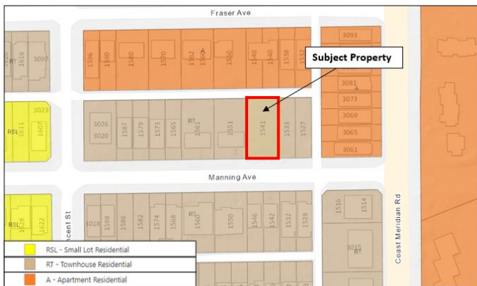
Current OCP Land Designation

Policy and Regulations: The Official Community Plan (OCP) designates the site as RT – Townhouse Residential to enable consideration of townhouse uses. OCP housing policies encourage a variety of housing types throughout the community to accommodate the needs of Port Coquitlam’s growing population. The current zoning of the property is RS1 (Residential Single Dwelling 1); the proposed zoning is RTh3 (Residential Townhouse 3).