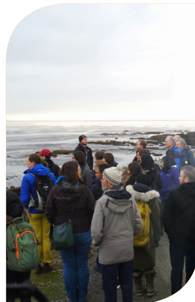
Flood managers and community group representatives discuss environmental and infrastructure issues in coastal flood management during a 2019 meeting and field tour in Richmond and Delta