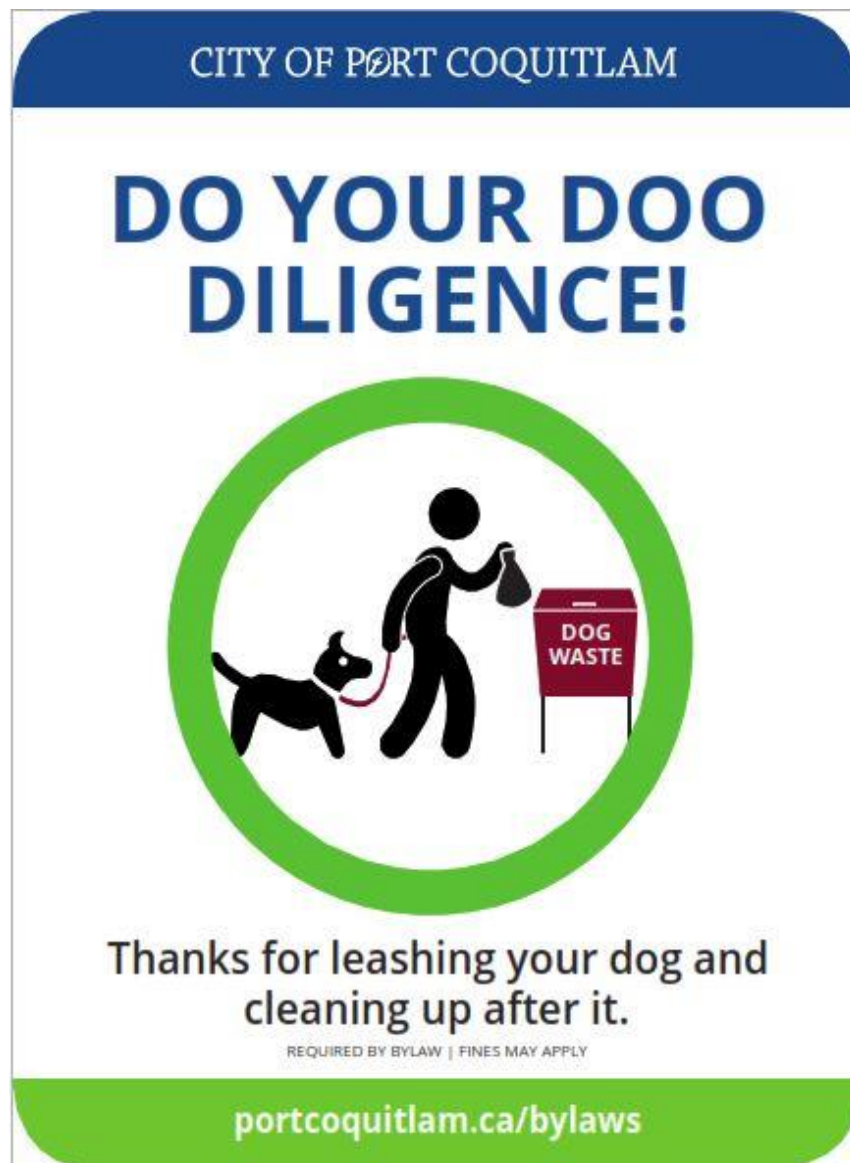
Figure 4 – New Dog Waste Signage Targeted Signage