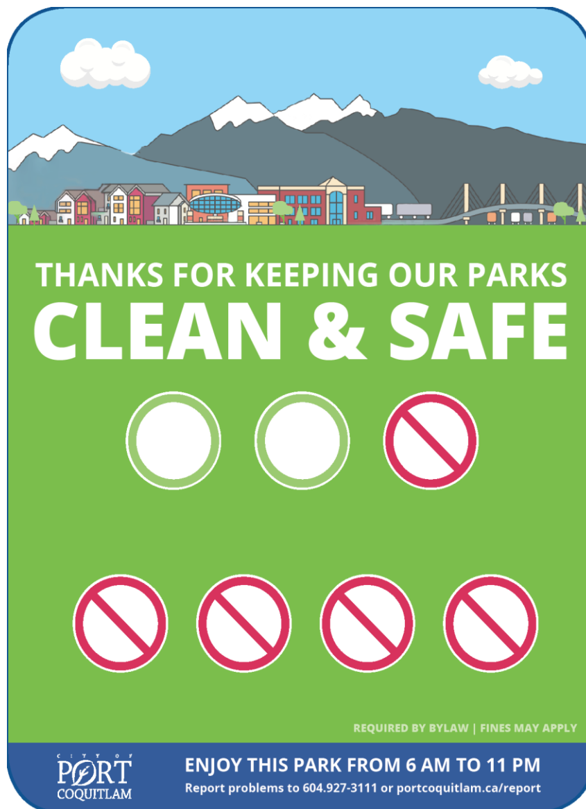
Figure 2 – New Entry Way Signage