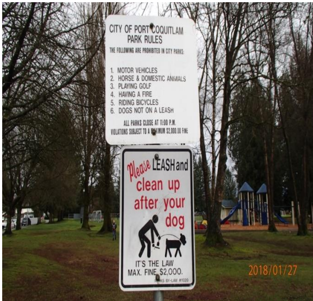
Figure 1 – Current Parks Bylaw Signage

Current signage is included in Figure 1 below for Council's reference and comparison.