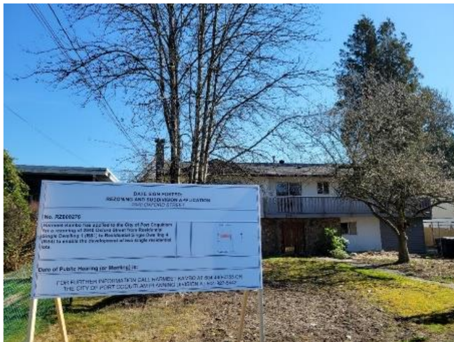
Development Sign on Site

The applicant has posted a development sign on the site. Staff visited the site on April 25 to confirm the sign is in good condition. The applicant provided a written summary of engagement with four neighbouring properties and advises they were supportive of the proposed redevelopment. No additional comments have been received by staff to date.